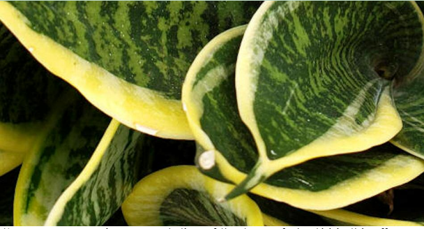
*Image on cover is representative of the type of plant(s) in this offer and not necessarily indicative of actual size or color for the included variety.